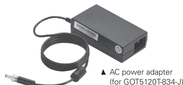
▲ AC power adapter (for GOT5120T-834-J)

* Specification and certifications are based on options and may vary.