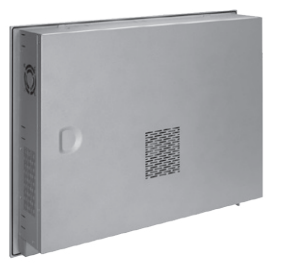
▲ Less screw design

© 2017 Axiomtek Co., Ltd. All rights reserved.