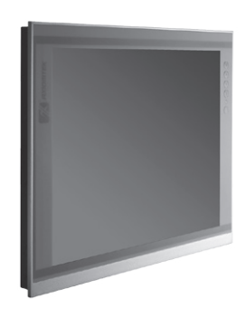
▲ Ultra-slim mechanism design